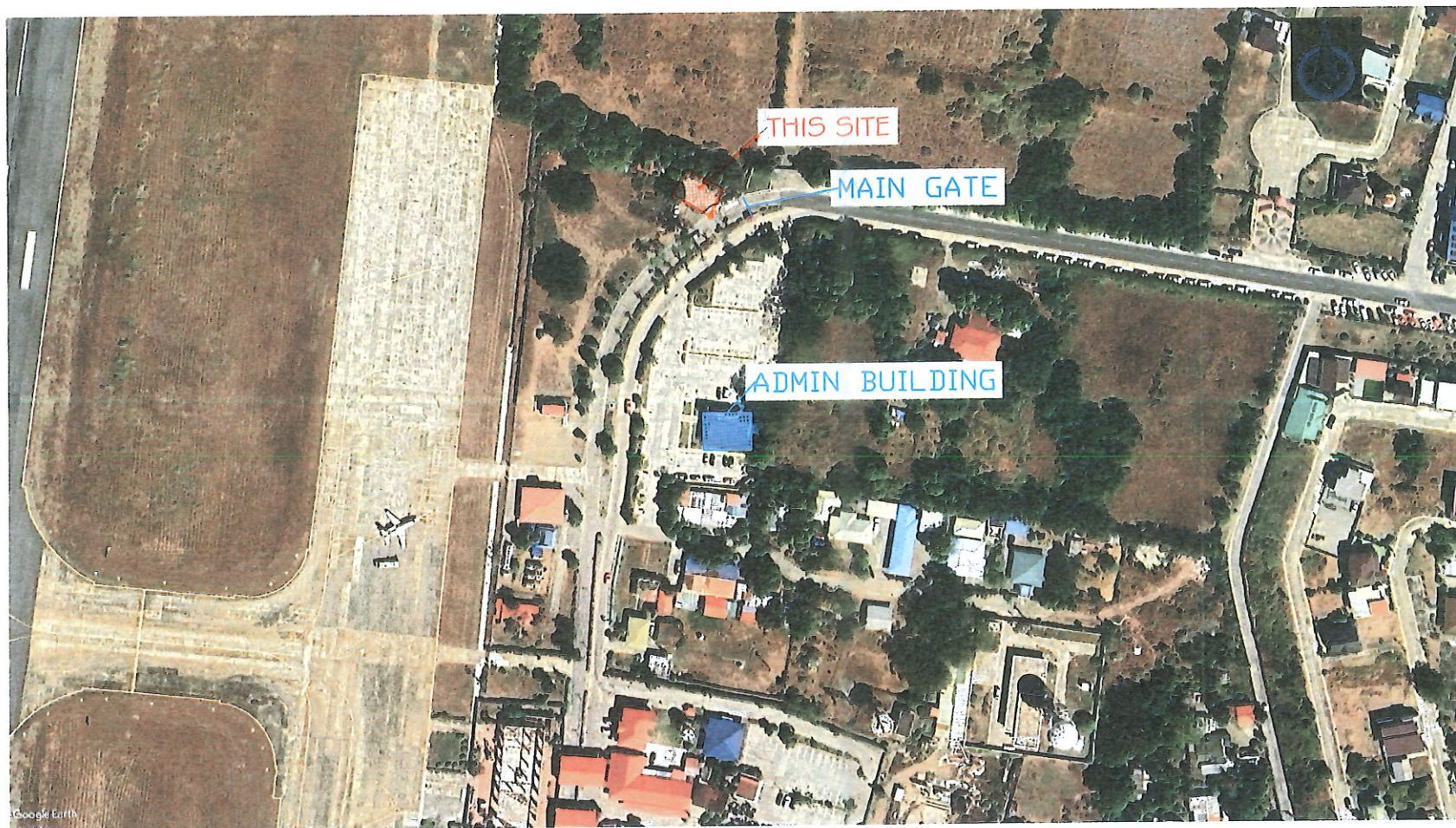
LAOAG INTERNATIONAL AIRPORT