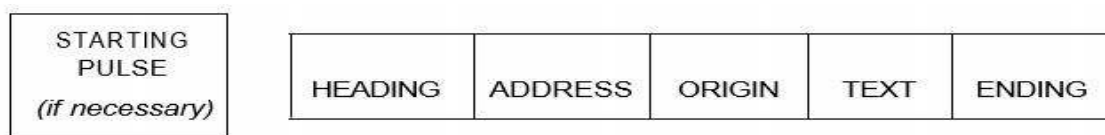
Figure 2.4-2. Form of transmission – teletypewriter operation (see 2.4.4.10.1.2)