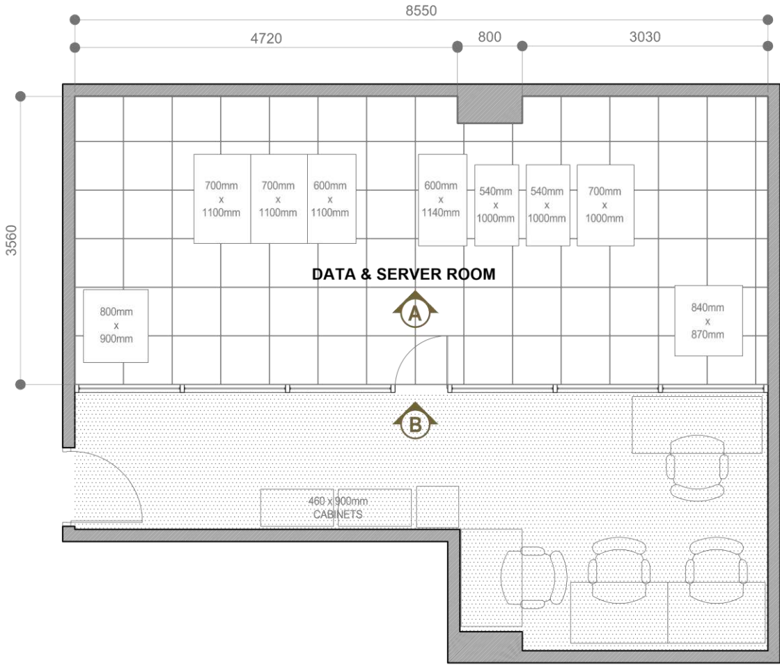
MISD OFFICE FLOOR PLAN SCALE: 1:50 MTS.