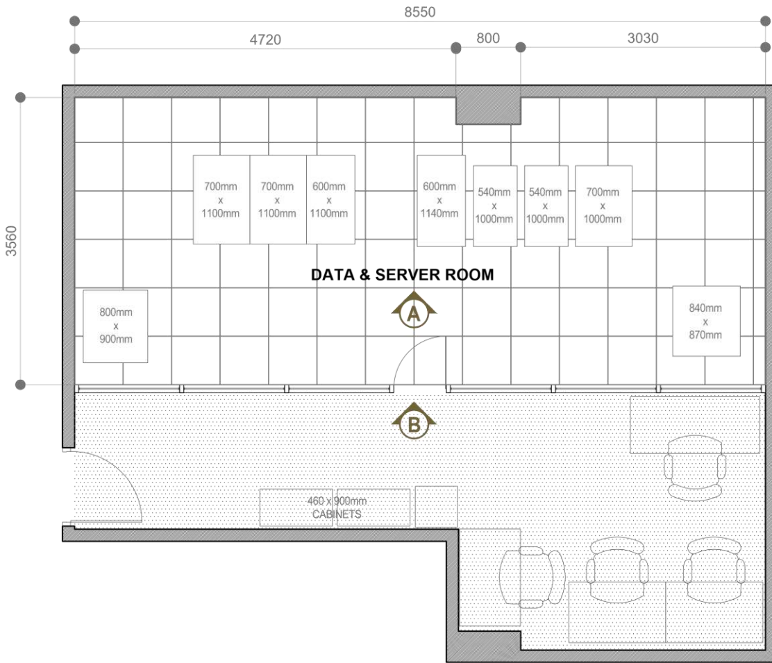
MISD OFFICE FLOOR PLAN SCALE: 1:50 MTS.