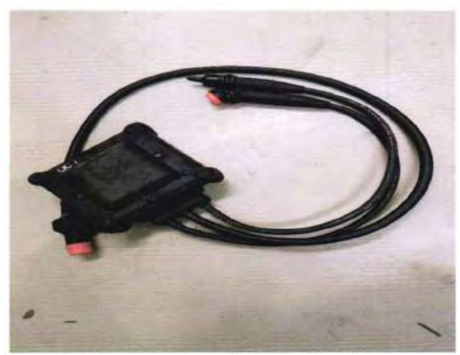
Isolation Transformer for Runway Edge Light