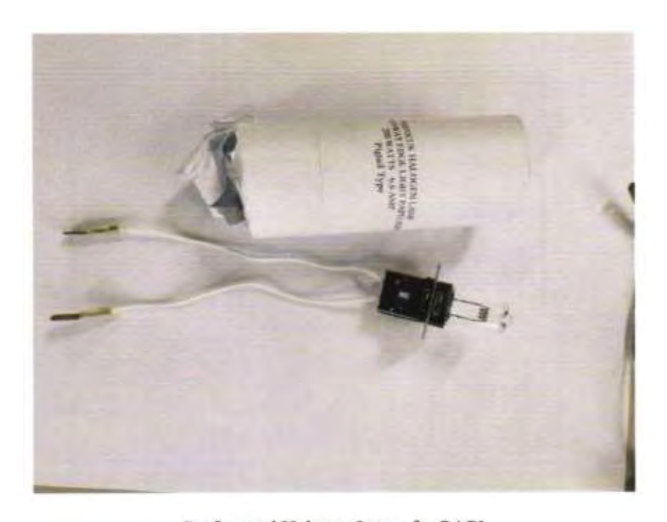
Prefocused Halogen Lamp for PAPI