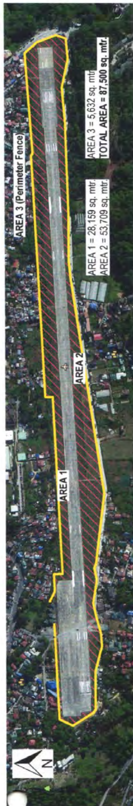
1 BAGUIO AIRPORT 1 : 5500