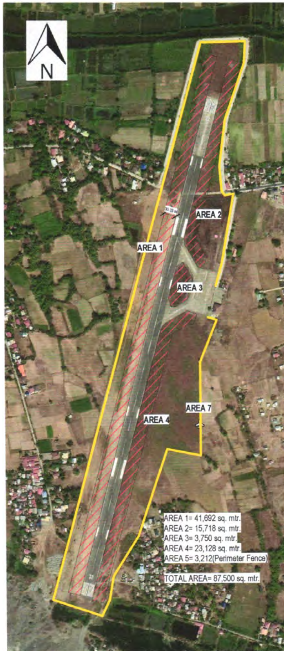
① VIGAN AIRPORT 1 : 5000