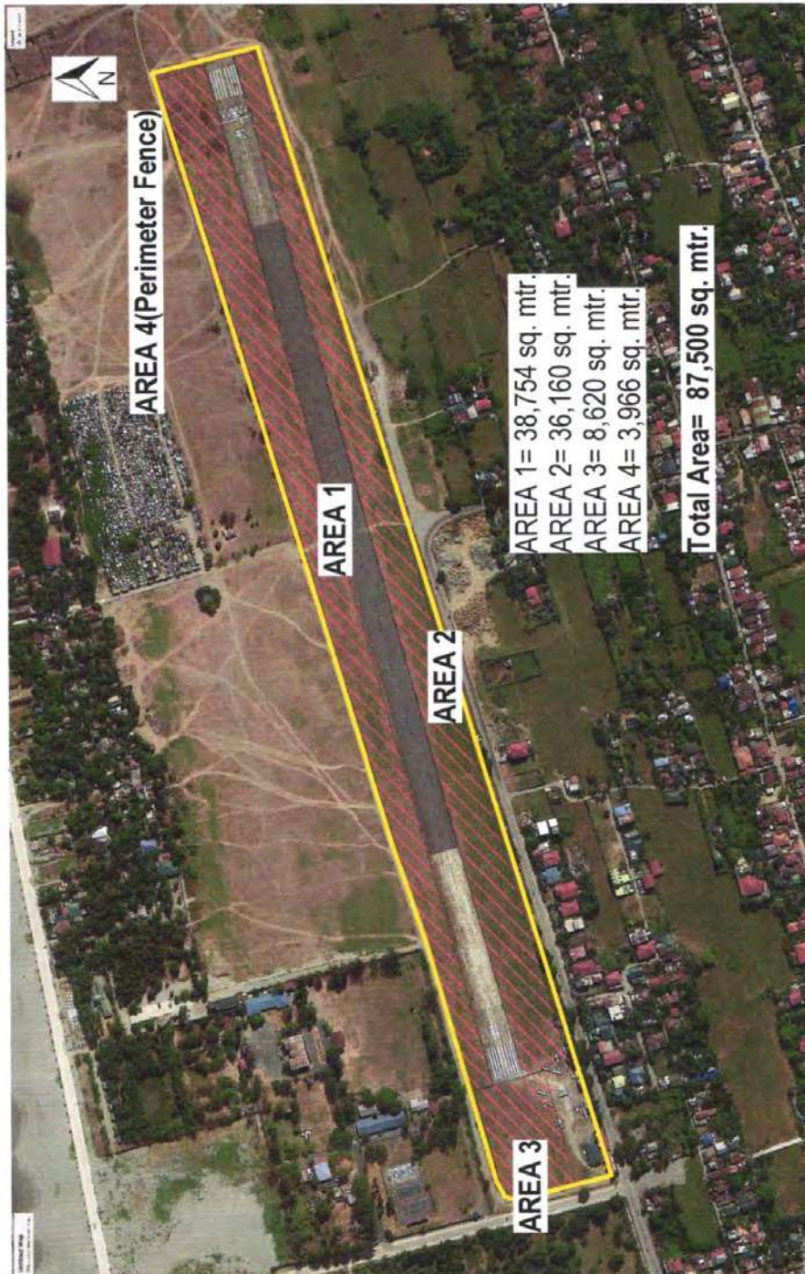
① LINGAYEN AIRPORT 1 : 4000