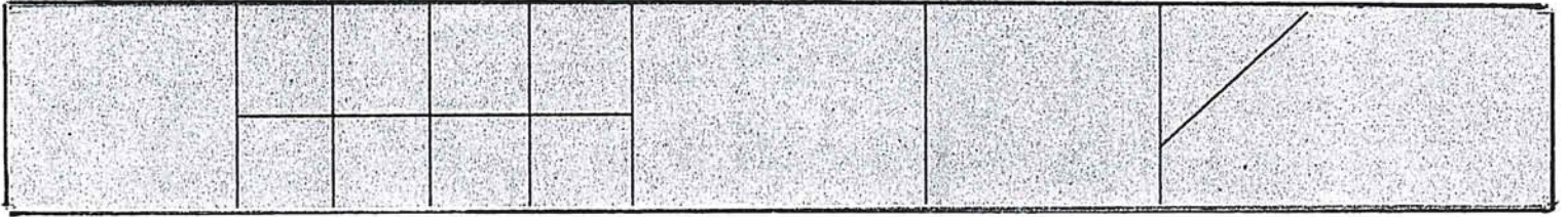
TOWER / APPROACH (YELLOW)